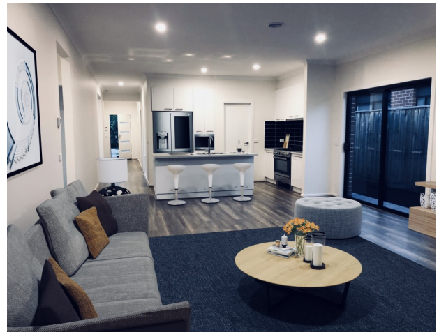
ACTUAL HOUSE IMAGE